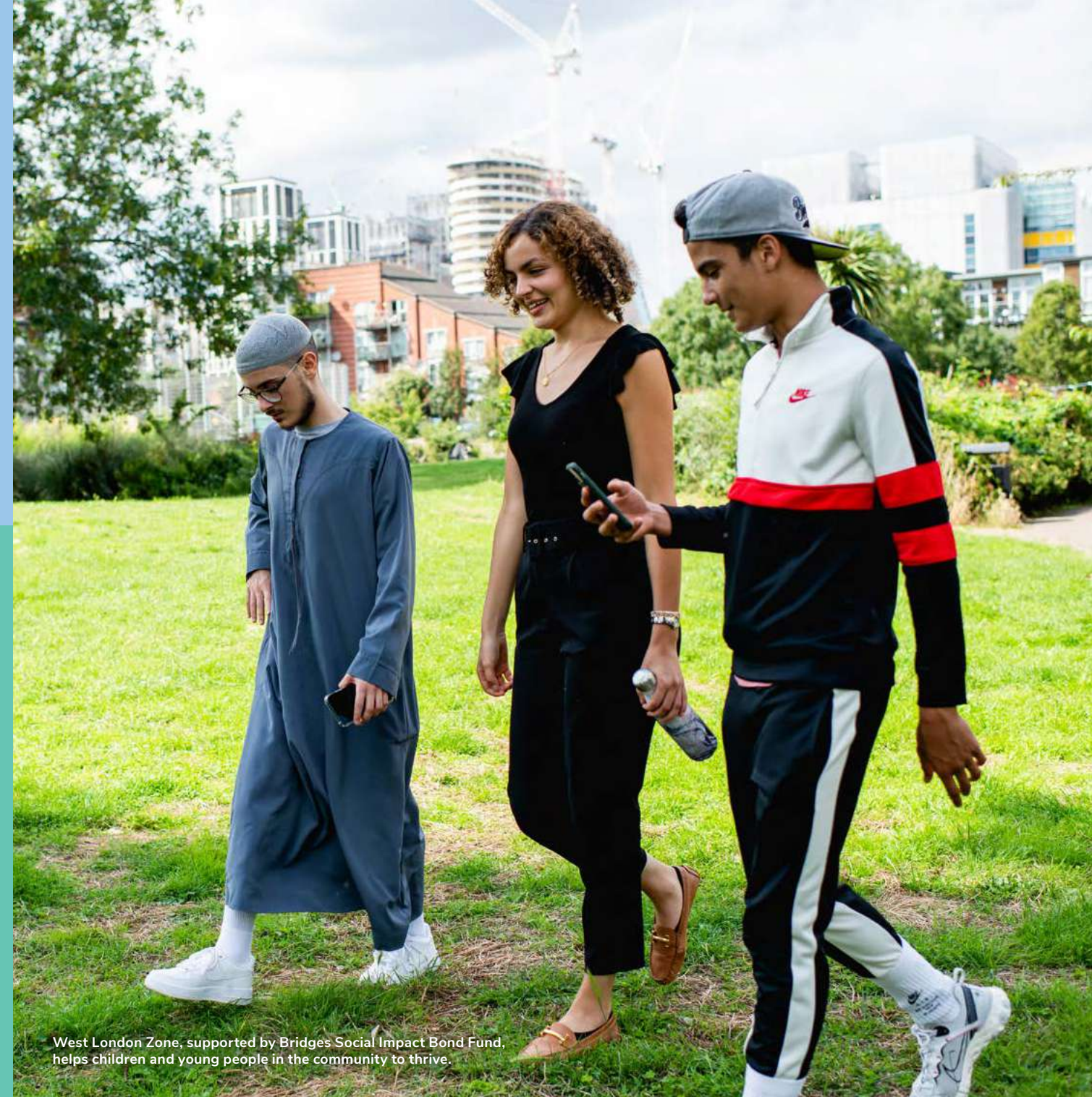
West London Zone, supported by Bridges Social Impact Bond Fund, helps children and young people in the community to thrive.